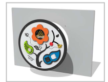
Insert can be easily attached to your own panel