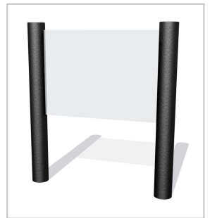
Round Section Attach panel to posts with brackets Brackets and fixings not included

Fixings - x4 Security Torx screws supplied with posts