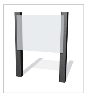
Square Section Screw through panel into posts Fixings not included