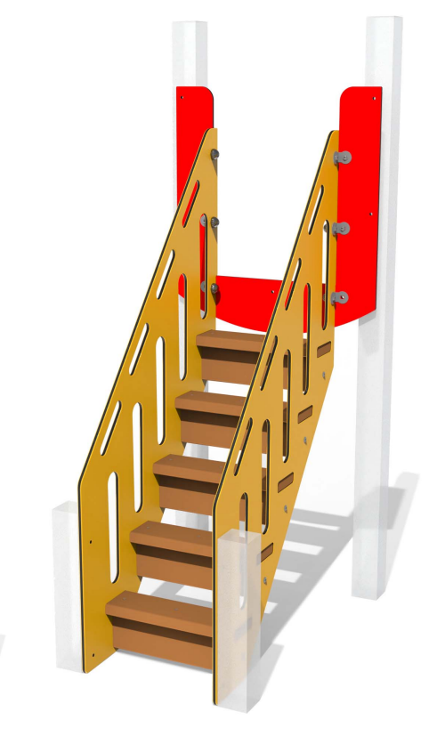
FIMPST1200-15 (For 1.2m Platform)