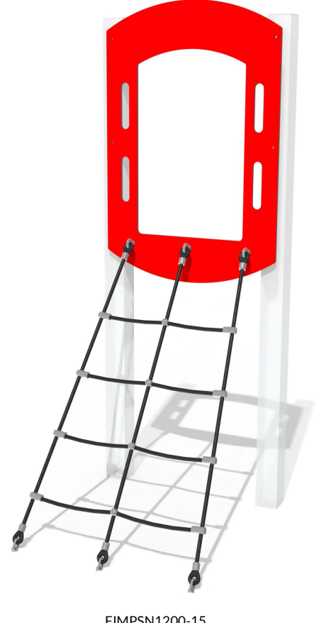
FIMPSN1200-15 (For 1.2m Platform)