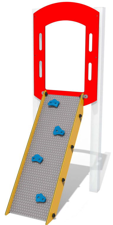
FIMPRP1200-15 (For 1.2m Platform)