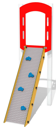
FIMPRP1500-15 (For 1.5m Platform)