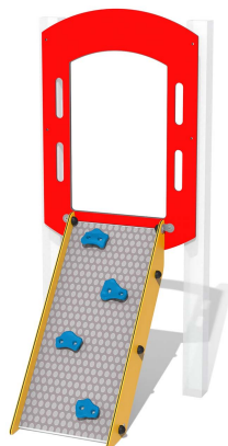
FIMPRP900-15 (For 0.9m Platform)