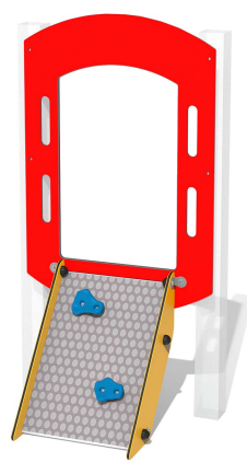
FIMPRP600-15 (For 0.6m Platform)