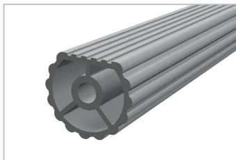
Slip Resistant Ladder Rung