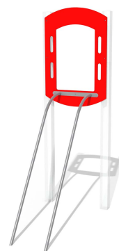
FIMPDBS1500-15 (For 1.5m Platform)