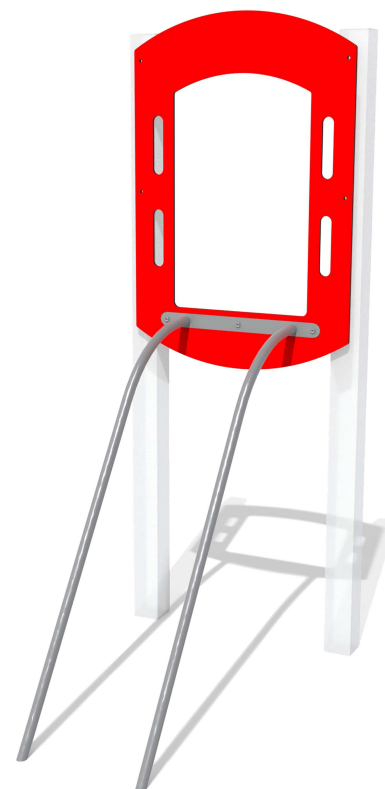
FIMPDBS1200-15 (For 1.2m Platform)