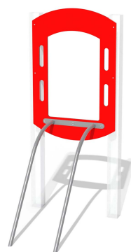
FIMPDBS900-15 (For 0.9m Platform)