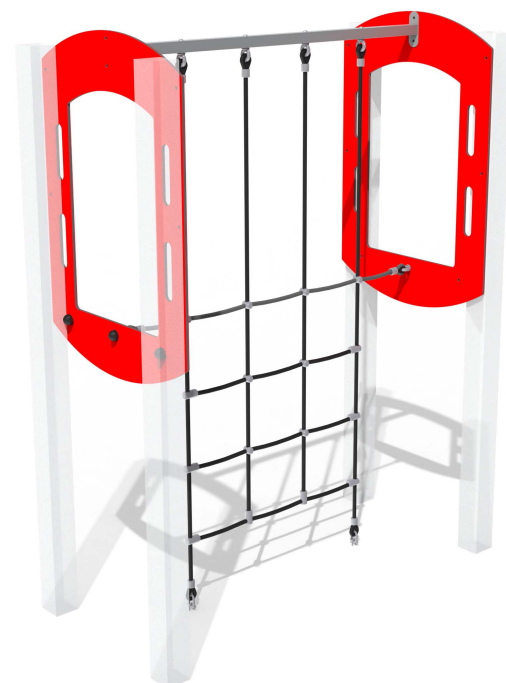
FIMPCNB1200-15 (For 1.2m Platform)