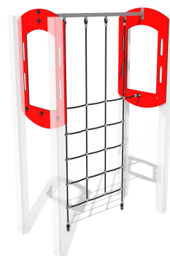
FIMPCNB1500-15 (For 1.5m Platform)