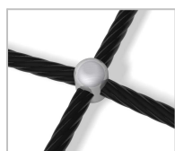
Steel Core Rope