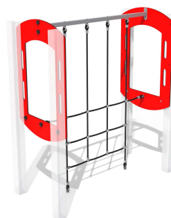
FIMPCNB900-15 (For 0.9m Platform)