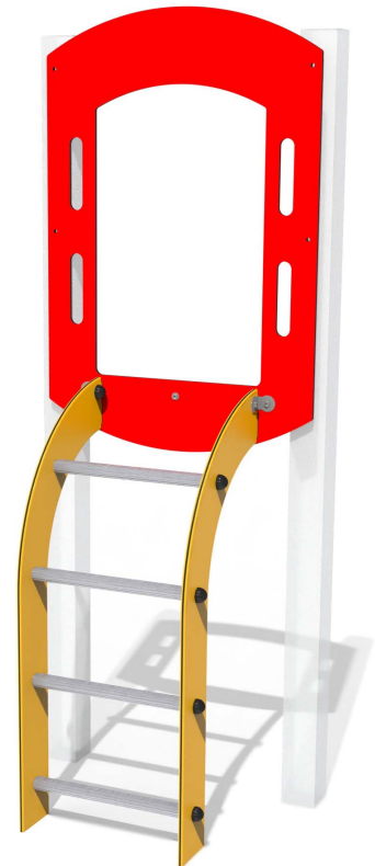
FIMPAL1200-15 (For 1.2m Platform)