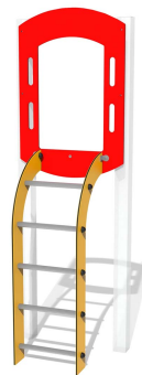
FIMPAL1500-15 (For 1.5m Platform)