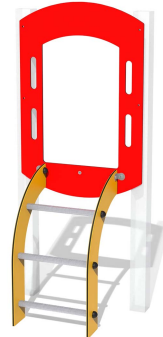
FIMPAL900-15 (For 0.9m Platform)