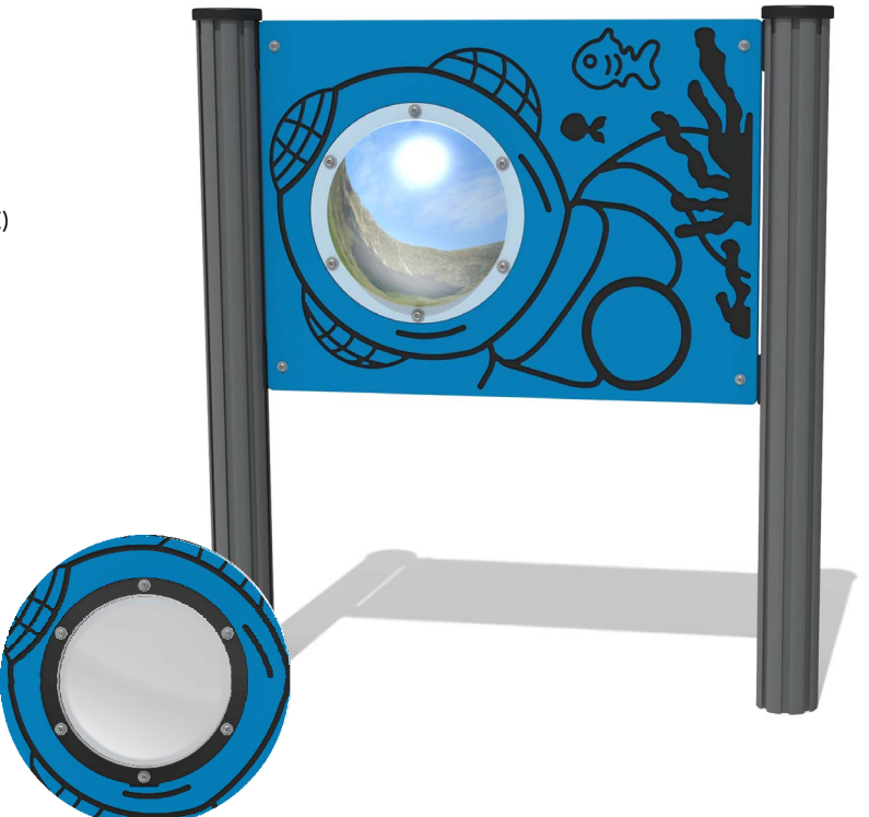
Panel available with mirrored dome or clear dome with cut-out